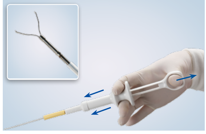
To reopen: Push the slider away from the thumb ring to reposition the clip as needed before deployment.