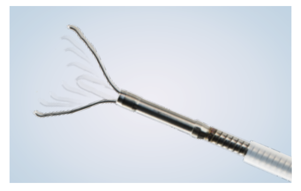
The clip will automatically open as it extends from the sheath. If you prefer to have the clip exit in a closed position, apply slight pressure to the slider of the handle as the yellow tube joint and handle are connected.