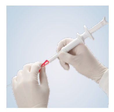
Once the device extends from the distal end of the endoscope, remove the red stopper.

Remove the device from the package. Remove the black protective cap. Confirm the yellow tube joint, red stopper and handle are connected without any gaps, and insert the device into the endoscopic channel.