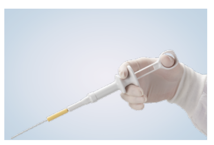
When the clip is in the desired position, remove your hand from the yellow stopper.