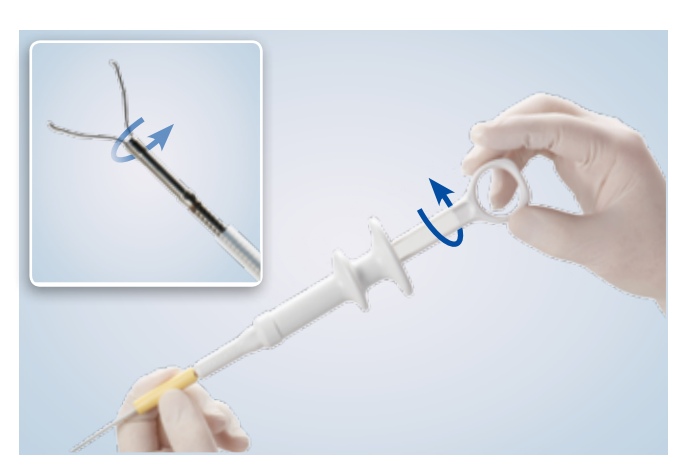
To align the clip with the target site, hold the yellow cylinder with one hand and rotate the entire handle with the other hand.