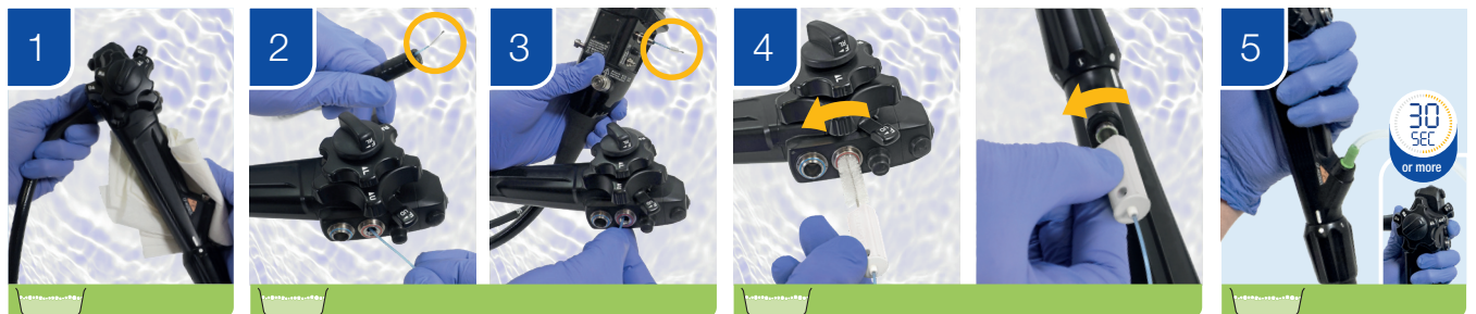
1 Immerse in freshly prepared detergent solution. Clean all external surfaces