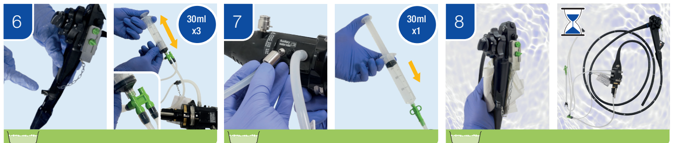
6 Flush the air/water channel with detergent solution