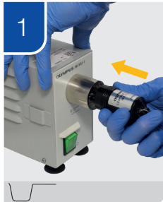
1 Attach Leakage Tester (MB-155)

DETACH ALL ACCESSORIES FROM ENDOSCOPE BEFORE LEAKAGE TESTING such as AW channel cleaning adapter (MH-948), suction valve (MH-443), auxiliary water tube (MAJ-855), biopsy valve (MB-358) or single use biopsy valve (MAJ-155) where applicable.