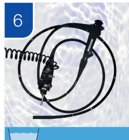
6 Fully immerse endoscope in water