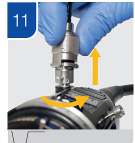
12 Disconnect Leakage Tester (MB-155) from endoscope