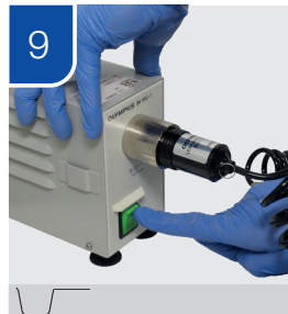
9 Turn off Maintenance Unit (MU-1)