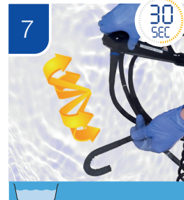
7 Angulate bending section