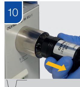
10 Remove Leakage Tester (MB-155) from Maintenance Unit (MU-1)