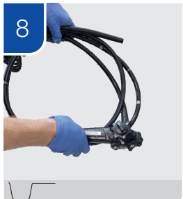
8 Remove endoscope from water. Maintenance Unit (MU-1) remains attached and switched on

! If the endoscope leaks, immediately remove from the water