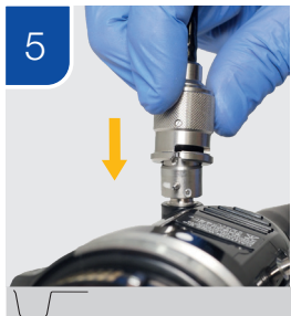
5 Attach Leakage Tester (MB-155) to endoscope