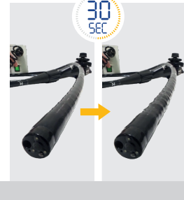
11 Wait 30 seconds, or until the covering of the bending section contracts to its pre-expansion size