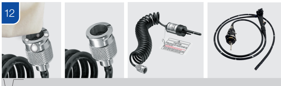
12 Dry the leakage Tester (MB-155)