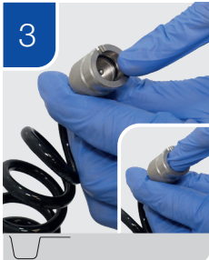
3 Pressure test Leakage Tester (MB-155)