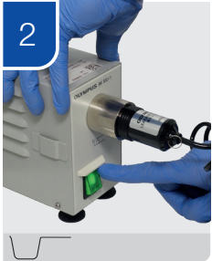
2 Turn on Maintenance Unit (MU-1)